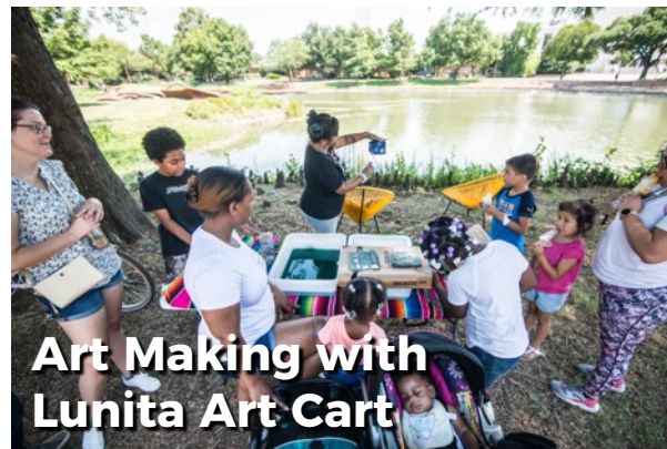
Art Making with Lunita Art Cart