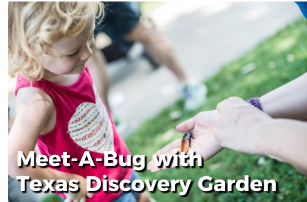
Meet-A-Bug with Texas Discovery Garden