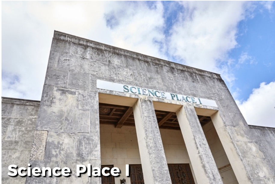
Science Place I