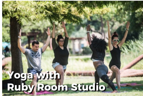
Yoga with Ruby Room Studio