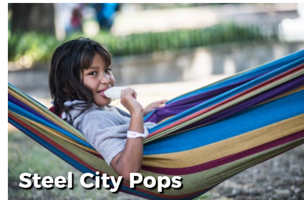
Steel City Pops