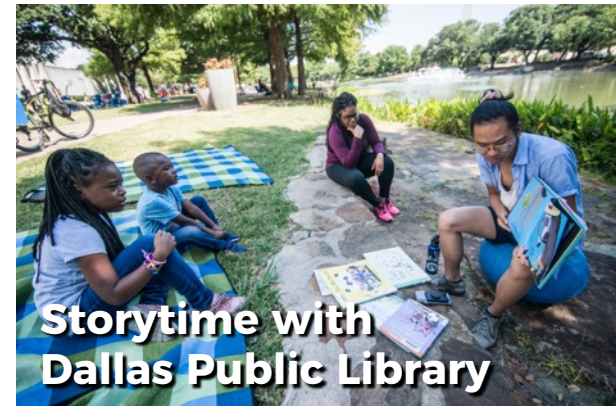
Storytime with Dallas Public Library