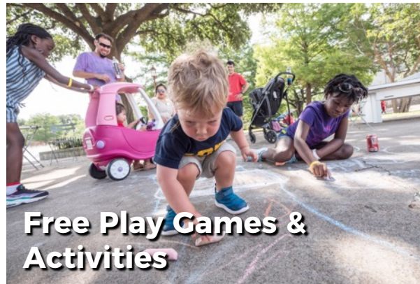
Free Play Games & Activities