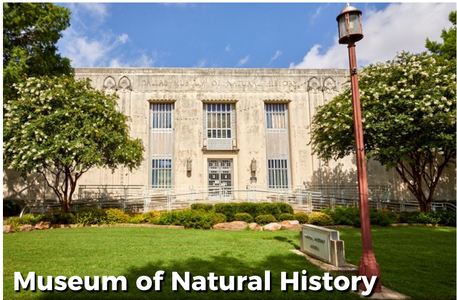
Museum of Natural History