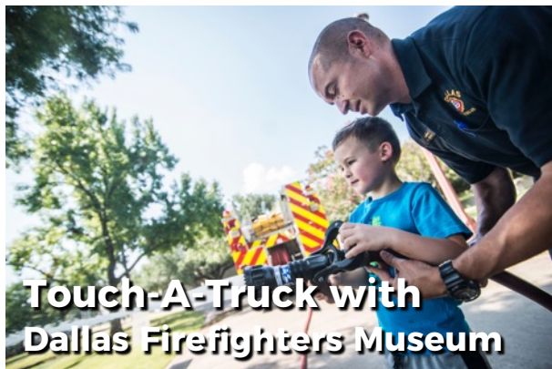
Touch-A-Truck with Dallas Firefighters Museum