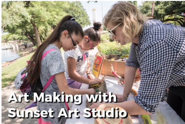
Art Making with Sunset Art Studio