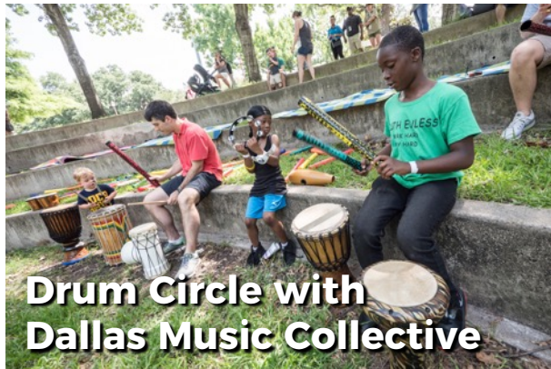
Drum Circle with Dallas Music Collective