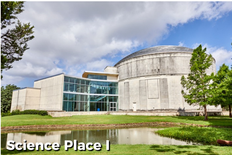
Science Place I